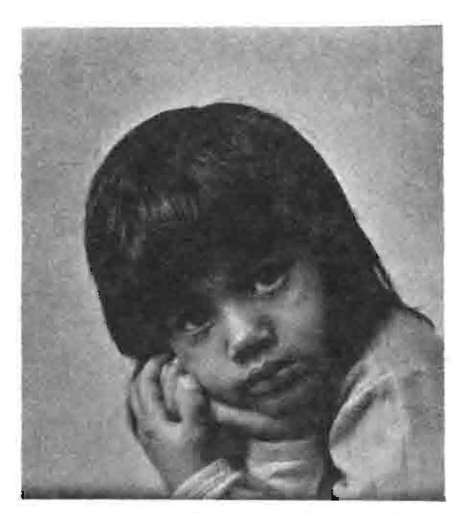
The caption for the above photo, which appeared in an advertisement for camera film, was entitled, "Swedish Girl."