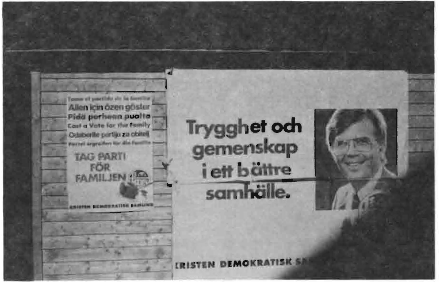
In the 1979 general elections in Sweden posters urging citizens to vote were printed in seven languages.