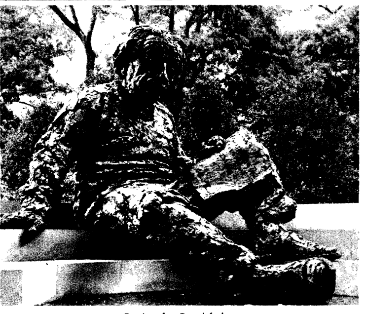
Paying for Bombfather

For example, in an article published in 1952 in the Journal of the Optical Society of America Ives mathematically exposes the fact that Einstein's vastly touted derivation of e=mc<sup>2</sup>, before which subsequent generations of physicists have knelt in pious adoration, was no derivation at all but a clumsy, mathematical fraud (Pt. II, pp. 182-185).